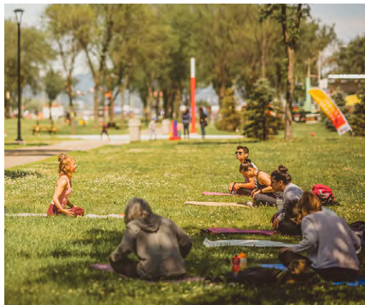
Mathieu Bélanger / ULaval