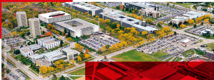
Marc Robitaille / ULaval