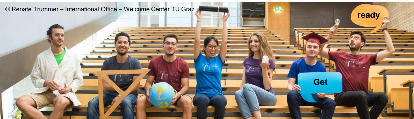
© Renate Trummer – International Office – Welcome Center TU Graz