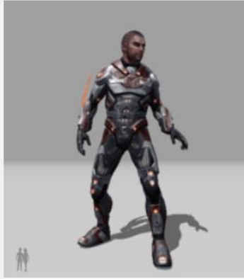
Ely By K.AtiENZA